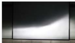
High Beam 远光