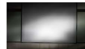
Low Beam 近光