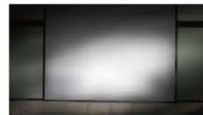
Low Beam 近光