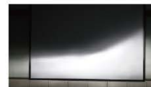
High Beam 远光